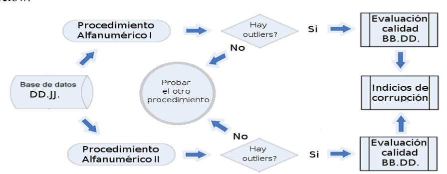
Fig. 2. Proposal for the application of hybrid procedures for the detection of anomaly fields in alphanumeric affidavit databases [Our own design].

The suitability of these hybrid procedures makes them a possible solution in civil auditing for the improvement of public and civic data of a given population. A possible solution and hypothetical application of civil auditing on open affidavit databases based on the above mentioned alphanumeric procedures are presented below: