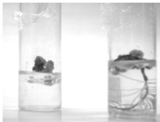
Figure 3. Rhizogenesis from culture callus in S2 medium.