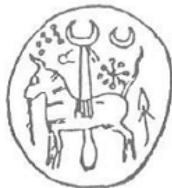
(Ornan, 2001, fig. 14 [detail])