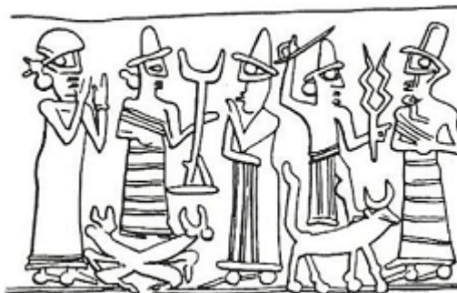
(Bennett & Keel, 1998, fig. 46)

Two stamp seals from the eighth or seventh century, one from Nineveh (figure 9) and one of unknown provenance (figure 10), depict a bull and a crescent on a pole, representing the Moon God. The crescent on the pole appears to stand on the bull's back, much like the lightning which was symbolic of the Storm God (Ornan, 2001, pp. 19-21).