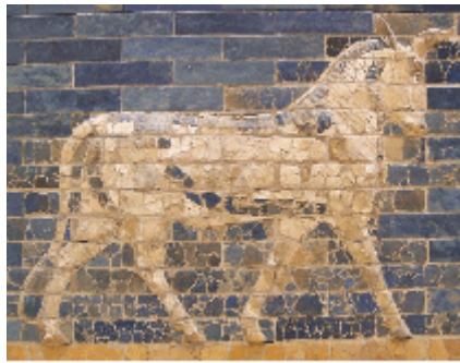
Figure 3: Bull representing Adad from the Istar Gate of Babylon