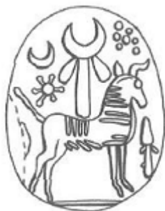
Figure 10: Stamp seal of unknown provenance