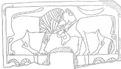
Ornan 2001:4 figure 2