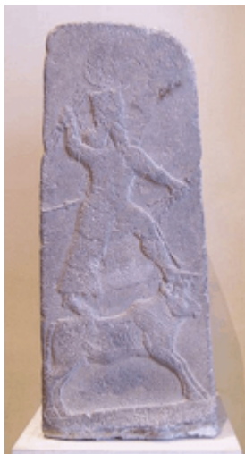
Figure 2: Stele of Adad from Arslan Tash

(Photograph taken by the author at the Louvre, Paris, April 2010)