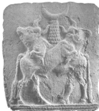
(Ornan, 2001, fig. 10)