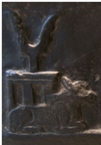
Figure 1: Stele of Meli-Shipak (detail)