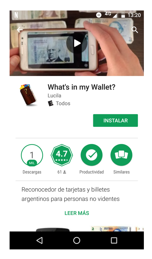
Figura 2. "What's in my wallet?" is available in Google Play for free. It has been downloaded more that a thousand times with a review score of 4.7.

cation is a 7.97MB file (available https://goo.gl/36VTM5). There is also a user manual available, but only in spanish for the moment (https://goo.gl/hBaeAq) "What's in my wallet?" is available in Google Play (Figure 2) for free. It has been downloaded more that a thousand times with a review score of 4.7.