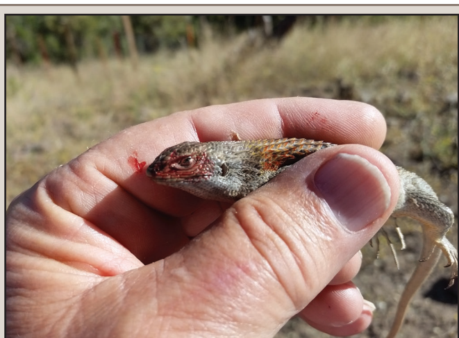
FIG. 1. View of dried blood on the eyes and face of Liolaemus nitidus shortly after pooled blood was swabbed after the captured lizard displayed ocular sinus bleeding in the field.

In the course of a larger study, at 1015 h on 25 February 2016, one of us (SFF) noosed an adult male Liolaemus nitidus from a site in the Andes of central Chile (Curva 31 along road to Farelones; 33.3559°S, 70.3229°W, WGS 84; 2160 m elev.) and upon taking it from the noose, noticed that it had expelled copious blood from both eyes (Fig. 1). This had never before been observed in the capture of hundreds of L. nitidus from this and previous studies at and near this site. The estimated amount of expelled blood was 0.05 ml. The blood pooled around both eyes and drained along the sides of the face and onto SFF's hands. Unfortunately, some of the blood was blotted and dried before photographs were taken. No blood was seen to be squirted. The male subject (74 mm SVL, 131.5 mm tail length, 13 g), was basking on a rock in the open when it was noosed. Weather was sunny with no wind. Air temperature was 32°C; lizard cloacal body temperature was 27.6°C. The subject was noosed no differently than any other lizard. After photographing and measuring the subject, it was released at the point of capture. In less than an hour later,