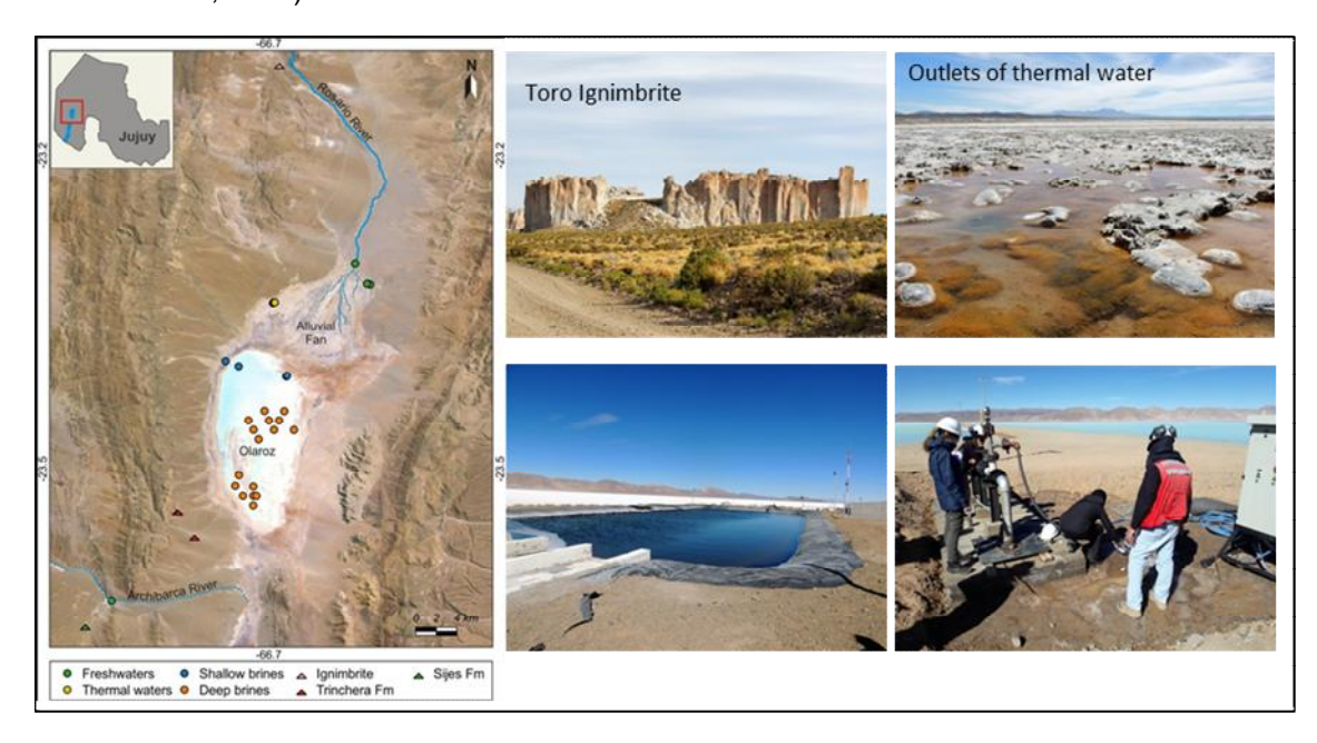
Figure 1. Study area and location of sampling points

chemical weathering of silicate rocks (e.g., clays and oxides/hydroxides), while ^{7} Li partitions preferentially into the associated water (i.e., Pogge von Strandmann et al. 2010). \delta 7Li values can be also a valuable tool to trace Li contributions from geothermal water inputs (Penniston-Dorland et al., 2017).