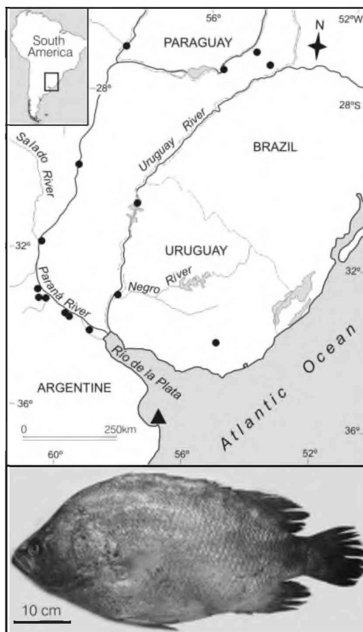
Fig. 1. ▲) First record of Oreochromis niloticus in the Samborombón Bay (36° 17' S - W 36° 46'), ●) aquaculture fisheries of O. niloticus in the Paranoplatense Basin.

The specimens caught measured 600, 580, 450 and 290 mm in total length and 4,900, 4,010, 2,350