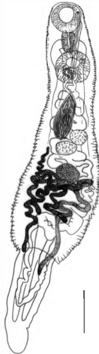
Fig. 1. Lecithocladium cristatum (schematic, in toto ). Scale bar = 0.5 mm

In a study on hemiurids in fish from the North Atlantic Ocean, Gibson and Bray (1986) revised the species of Lecithocladium and divided them into seven groups according to body size, sucker ratio and egg length. Based on these parameters, the digenean species studied in our research could