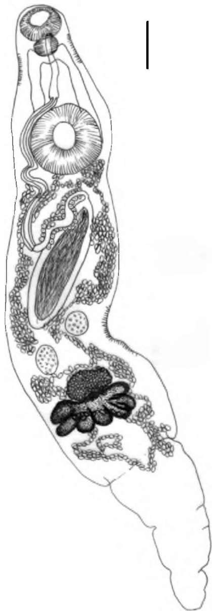
Fig. 2. Elytrophalloides oatesi (schematic, in toto ). Scale bar = 0.2 mm

E. oatesi has also been cited in approximately 11 fish species from waters adjacent to the Malvinas (= Falkland) Islands (Zdzitowiecki 1997, Kohn et al. 2007). Our research reports the first citation of E. oatesi in Silver warehou, S. porosa .