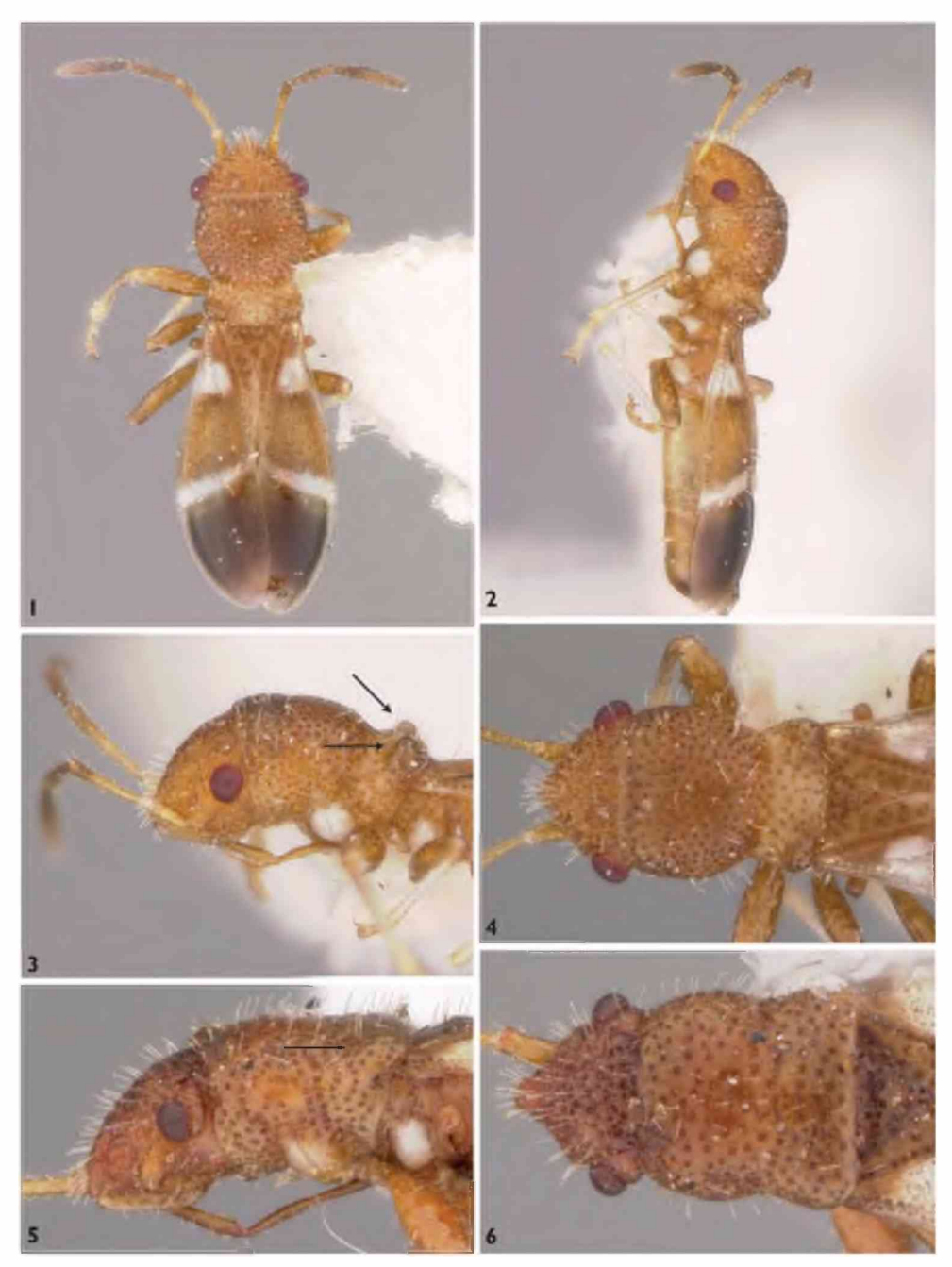
Figures 1–6. 1–4 Notocoderus argentinus , holotype male I Dorsal aspect 2 Lateral aspect 3 Head and pronotum, lateral aspect (arrows indicate position of posterolateral pronotal tubercles) 4 Head and pronotum, dorsal aspect 5 , 6 Dycoderus picturatus 5 Head and pronotum, lateral aspect (arrow indicates rounded posterolateral pronotal angle lacking a distinct tubercle) 6 Head and pronotum, dorsal aspect.