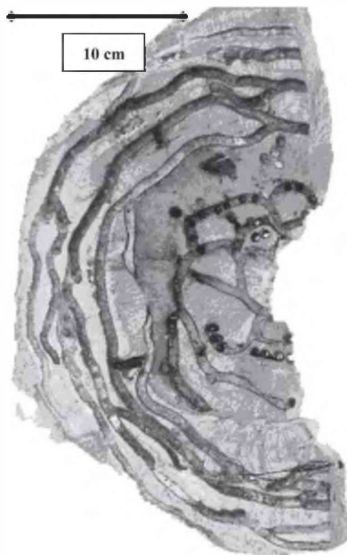
Figure 6. Gallery system of Megaplatypus mutatus .

We conclude that M. mutatus is a threat to the fruit tree industries and forest resources in many areas of the world. In North America, this insect is of particular concern to California, Oregon and Washington, and to the west coast of British Columbia, where significant plantations of hybrid poplars and a large fruit industry occur and temperature regimes are favourable for this pest.