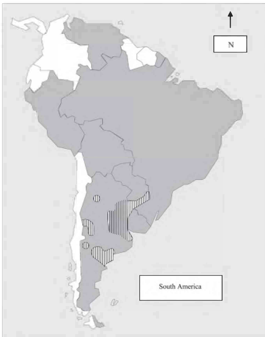
Figure 1. The occurrence by country (denoted in grey; after Wood and Bright, 1992) and generalized distribution in Argentina (cross-hatched) of Megaplatypus mutatus (Chapuis) (modified from Giménez and Etiennot, 2003).

P. plicatus Brethes, 1909, was synonymized by Bosq (1934, cited in Wood and Bright, 1992).