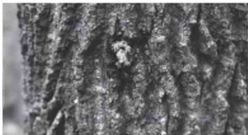
Figure 4. Entrance hole of Megaplatypus mutatus .