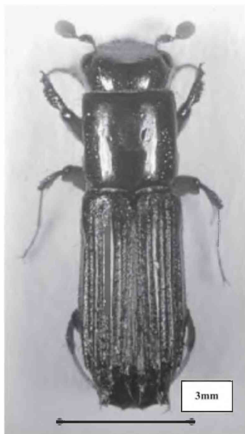
Figure 2. Adult Megaplatypus mutatus .

and spiral in shape (Figure 6). Larval galleries are short and are oriented vertical to the parental galleries. The walls of adult and larval galleries are covered with the mycelia of Raphaelea santoroi . In the Delta region of the province of Buenos Aires, Argentina, new adults emerge between November and January.