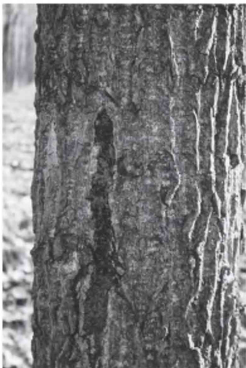
Figure 5. Exudation of sap by attacked poplar tree.

We conclude that M. mutatus is a threat to the fruit tree industries and forest resources in many areas of the world. In North America, this insect is of particular concern to California, Oregon and Washington, and to the west coast of British Columbia, where significant plantations of hybrid poplars and a large fruit industry occur and temperature regimes are favourable for this pest.