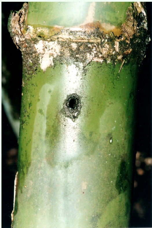
Figure 5. Internodes of Guadua chacoensis (Rojas) Londoño and Peterson (Poaceae) with a hole in the wall. High quality figures are available online.