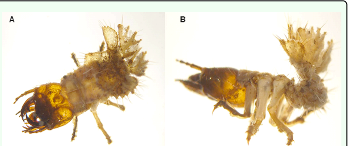
Figure 10. Habitus of larva of Pachyteles sp. (Carabidae), A: dorsal ; B: lateral. High quality figures are available online.