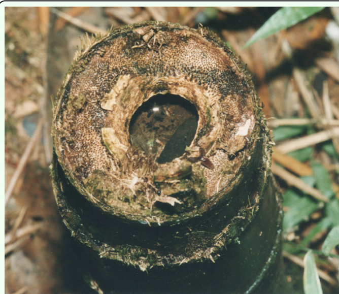
Figure 6. Stumps of Guadua chacoensis (Rojas) Londoño and Peterson (Poaceae). High quality figures are available online.