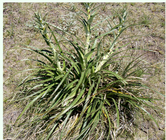
Figure 2. Eryngium horridum Malme (Apiaceae) at the field site in Sierra de la Ventana, Buenos Aires Province. High quality figures are available online.