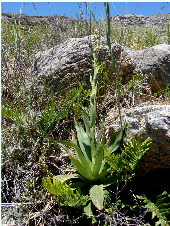
Figure 3. Eryngium aff. serra Cham. and Schlttdl. (Apiaceae) at the field site in Sierra de la Ventana, Buenos Aires Province. High quality figures are available online.