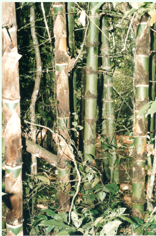
Figure 4. Guadua chacoensis (Rojas) Londoño and Peterson (Poaceae) at the forest site in Iguazú National Park, Misiones Province. High quality figures are available online.