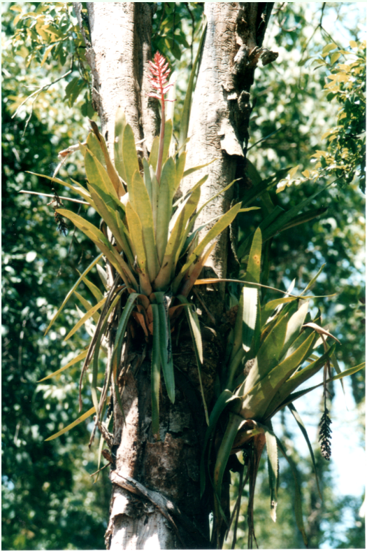
Figure 7. Aechmea distichantha Lemaire (Bromeliaceae) at the field site in Iguazú National Park, Misiones Province. High quality figures are available online.