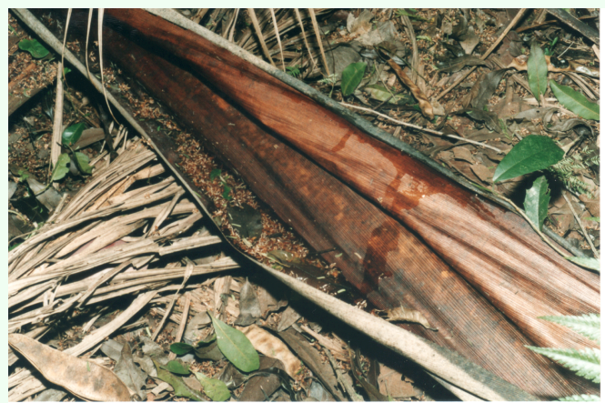
Figure 8. Fallen floral bracts of the palmetto Euterpe edulis Martius (Arecaceae) at the field site in Iguazú National Park, Misiones Province. High quality figures are available online.