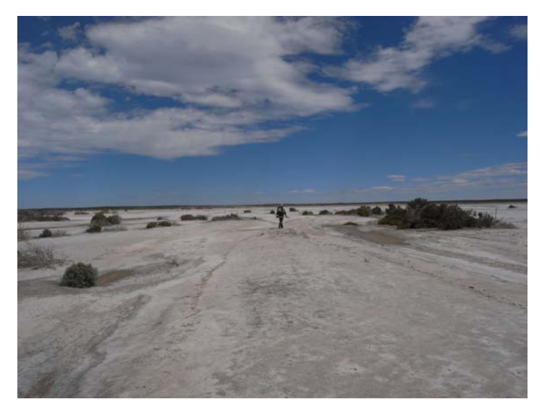
Figure 4. Salitral near the village in Bahía Bustamante.