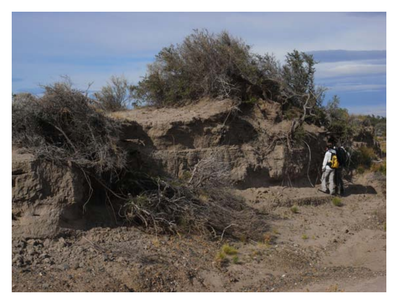
Figure 6. Stabilized dune covers fluvial deposits in Cañadón Restinga.