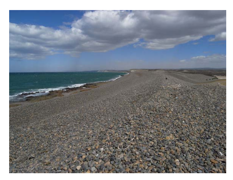
Figure 3. Holocene Beach ridge series in Península Aristizábal.

metres thick to series of relict forms that are very large and thick. These latter may extend several kilometres inland rising to more than one hundred metres above current sea level. These deposits may occur in singular form often dissected by fluvial erosion, or as sets characterised by crests located at the same elevation (Figure 3). Their curvature varies from almost straight (in the higher and older forms) to very curved, tracking the variation of the shoreline geometry in time.