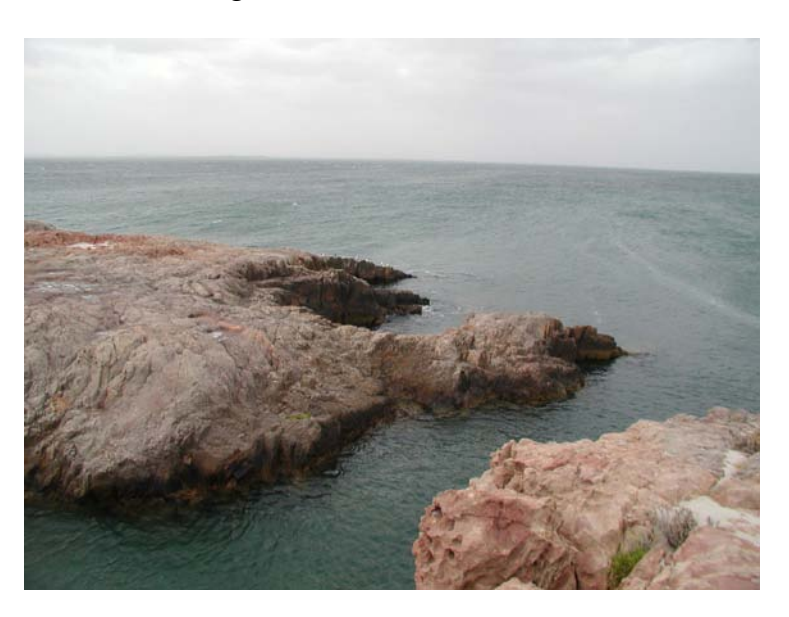
Figure 2. Rocky shore platform in the Península Gravina.

The low amount of precipitation (<300 mm/yr) and moderate thermal amplitude allow the growth of a sparse cover of grass and shrubby vegetation, consistent with the semi-arid climate of Patagonia. The oldest rocky substrate, Complejo Marifil, consists of Jurassic rhyolites, ignimbrites and volcanoclastic conglomerates. It is often covered by thin to very thick debris deposits and crops out basically in current and paleo rocky shore lines, islands and cliffs (Figure 2).