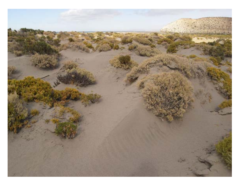
Figure 7. Dunes in Península Aristizábal.