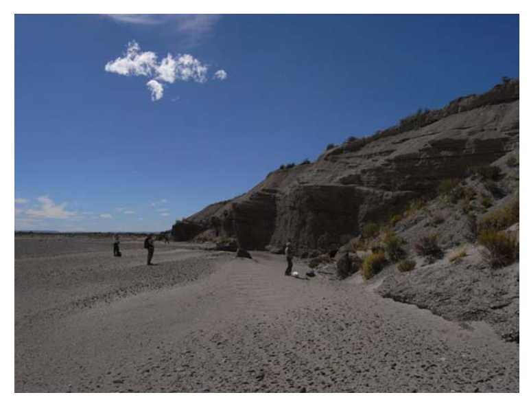
Figure 5. Section in marine deposits along the Cañadón Malaspina.

high concentration of organic material. Generally they are covered by typical halophyte plants.