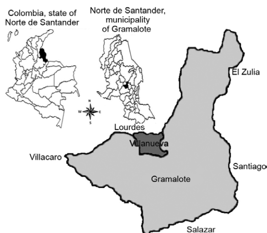
Fig. 1: study area: Villanueva, municipality of Gramalote, Norte de Santander, Colombia.

The frequency of Pi. spinicrassa collected with protected human bait was higher in the peridomicile area than in the intradomicile area ( p < 0.003 ), whereas the highest frequencies found for the automatic light trap (CDC) collections were observed in the intradomicile area ( p < 0.014 ). The highest Williams' average (11.5 insects/trap) was obtained for the forest, followed by the