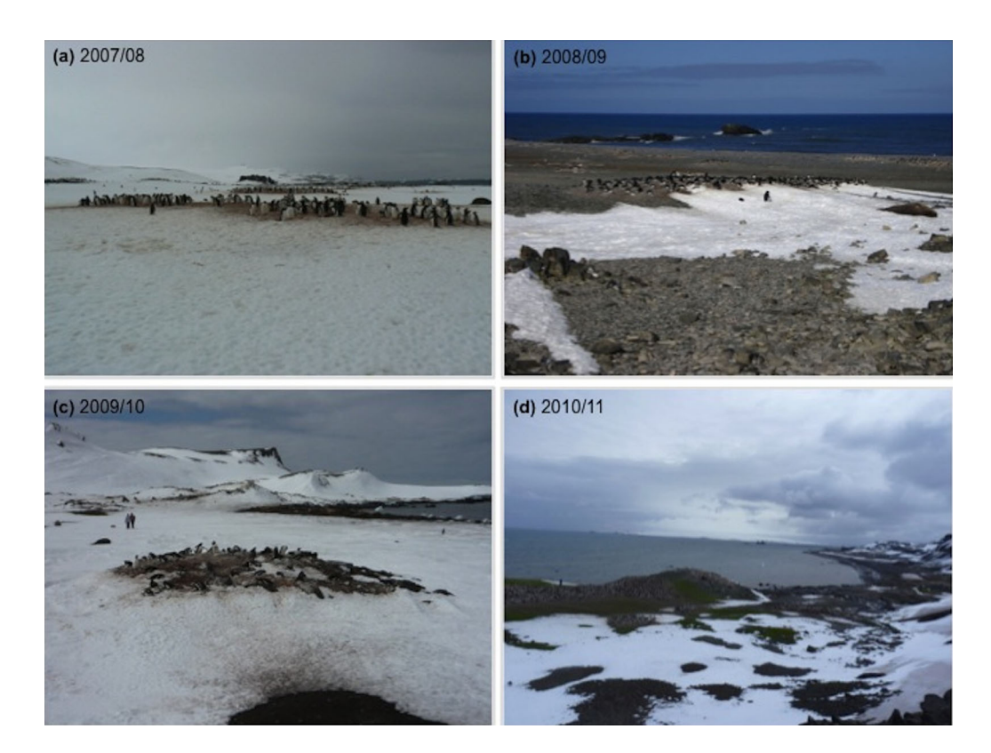
Fig. 2 Interannual comparison of local conditions recorded at the Stranger Point colony, from 2007/08 to 2010/11: (a) 2007: first week of November; (b) 2008: 10 November; (c) 2009: 5 December; (d) 2010: last week of November.

Considering the entire colony, overall breeding success remained relatively stable and high (Table 2), without any interannual differences ( \chi^2 test = 5.768, df = 3, P = 0.155). However, pairs nesting in area A showed interannual variability in their breeding success ( \chi^2 test = 10.704, df = 3, P = 0.013). The 2009 season had the lowest production of CS chicks (2007 vs. 2009: \chi^2 test = 8.664, df = 1, P = 0.003; 2008 vs. 2009: \chi^2 test = 4.226, df = 1, P = 0.04; 2009 vs. 2010: \chi^2 test = 6.088, df = 1, P = 0.014). During 2009, only 27.6% of chicks reached CS, while 72.5, 56.4 and 61.2% of chicks reached it in 2007, 2008 and 2010, respectively. However, no interannual variability was observed in the success of pairs nesting in area B (\chi^2 \text{ test} = 1.16, df = 3, P > 0.05) . When comparing seasonal breeding success, differences between A and B groups were found only for 2009, in which the breeding success of area A pairs was significantly lower ( \chi^2 test = 5.503, df = 1, P = 0.019).