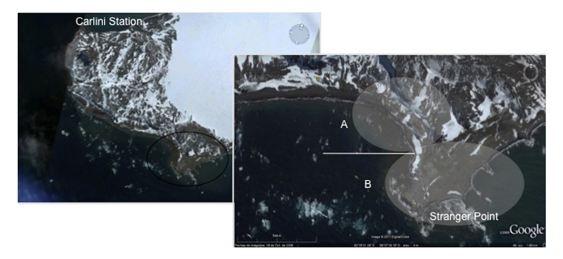
Fig. 1 Study area. Gentoo penguin ( Pygoscelis papua ) colony at Stranger Point, King George Island (Isla 25 de Mayo), South Shetland Islands. The division of the colony into areas A and B is shown.

as a breeding group. The aggregation of breeding groups within a discrete area was regarded as a colony.