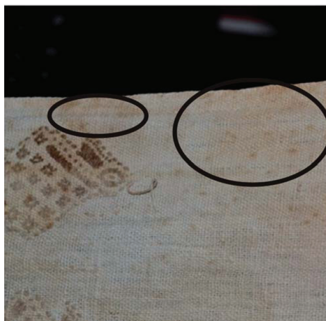
Figure 1 General view of textile No. 60177 at La Plata Museum where foxing spots are observed.

Pre and post-Columbian archeological textiles from the Southern Andean area, sheltered in Deposit 25 at La Plata Museum (Fig. 1), were analyzed by Olympus BX51 optical microscopy (OM) (Fig. 2A and 3A), FEI Quanta 200 scanning electron microscopy (SEM) (Figs. 2B and 3C) and Leica SP5 confocal laser scanning microscopy (CLSM) (Fig. 3B) with the aim of studying their biodeterioration 3 . For over 120 years, these textiles have provided information to archeologists around the world, and it was through the study of many pieces that we now know in detail the characteristics of the material culture of the various groups that inhabited the territory during the national Holocene period. Textiles containing natural fibers, and cotton fabrics can present problems when exposed to unfavorable external conditions. High humidity and temperature and insufficient air circulation result in enhanced growth of microorganisms, especially fungi 2 . Uncontrolled fungi growth leads to the complete deterioration of archeological fibers. Microorganisms such as fungi and bacteria (ie. Cladosporium sp. and Pseudomonas sp.) (Fig. 3) cause the biodeterioration of cellulose, which