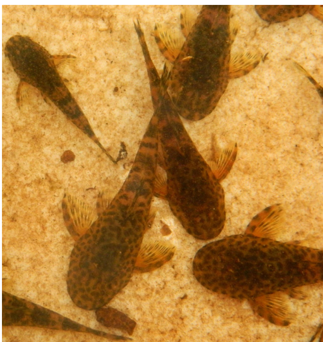
FIGURE 4. Live Eurycheilichthys pantherinus recently collected.

in the following collections: CI-FML 5875 (6), CI-FML 5876 (2 c&s), and MCP 48035 (2). Institutional abbreviations follow Sabaj-Pérez (2012).