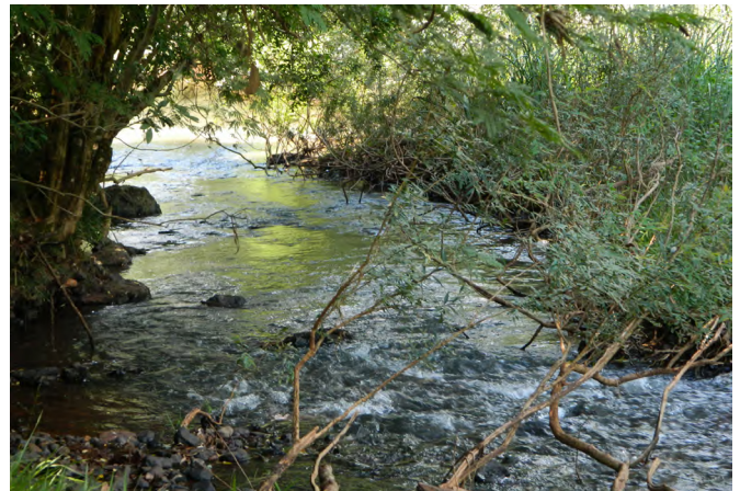
FIGURE 1. Habitat where Eurycheilichthys pantherinus was collected: Arroyo Garibaldi, Misiones, Argentina.