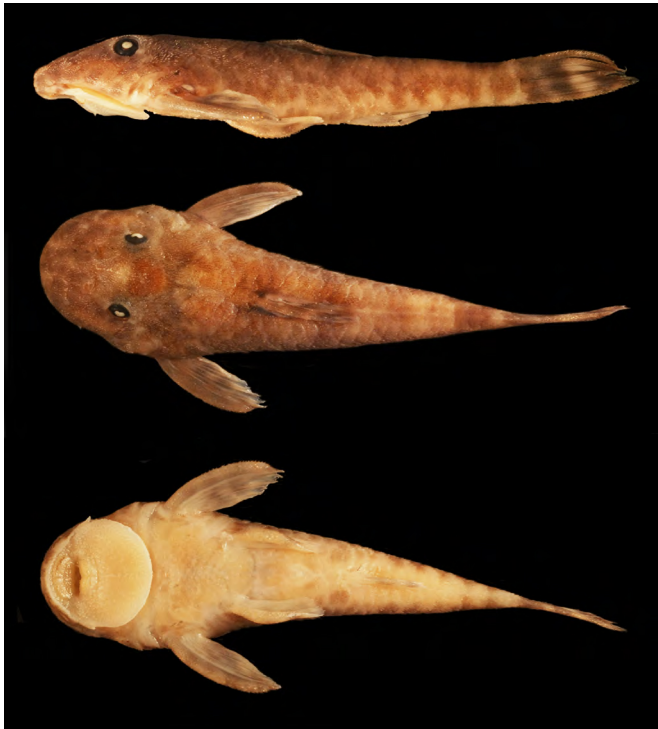
FIGURE 3. Eurycheilichthys pantherinus , lateral, dorsal, and ventral views. CI-FML 5875, 31.2 mm SL.

Measurements and counts of 10 specimens are provided in Table 1. Measurements were taken following Reis and Schaefer (1992). The examined specimens of E. pantherinus (Figure 3) have lower number of lateral plates; the counts of all remaining plates agree with those of Reis and Schaefer (1992). The specimens have been deposited