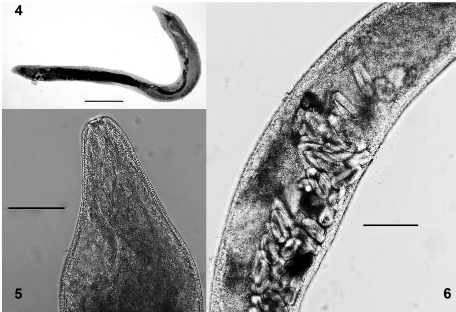
Figures 4 to 6. Sulphuretylenchus sp. 4. Mature parasitic female from host, 5. Head of the female, 6. Larvae inside the female's body. Bars= 4: 500 µm; 5, 6: 100 µm.

The uterus is enormous, filling most of the body cavity (Fig. 2). The ovary coiled in anterior region. The tail end conoid-rounded, with a peg-like projection (Fig. 3). Generally ovoviviparous. No male or complete generative cycle in host. (Laumond & Hervé Mauléon 1982, Poinar et al. 2004, Siddiqi 2000).