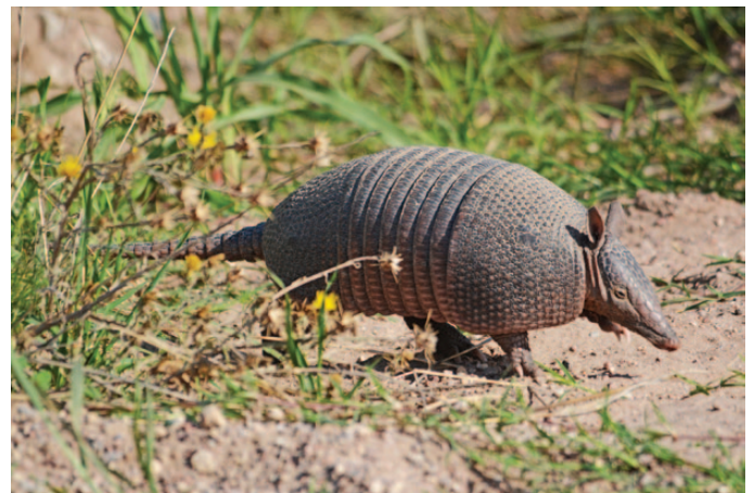
Fig. 1. —A Dasypus hybridus from Saavedra, Buenos Aires Province, Argentina.

Zonoplites Gloger, 1841:114. No species mentioned, name proposed for armadillos with 4 toes on forefeet, the 2 middle toes being longer than the outer toes.