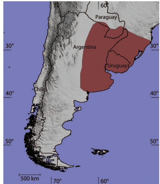
Fig. 4.—Geographic distribution (brown) of Dasyus hybridus . Map redrawn from Abba and Superina (2010) with modifications.

Dasyus hybridus is found in Argentina, Uruguay, Paraguay, and southern Brazil (Fig. 4). The exact northern limit of its range is uncertain due to its morphological similarity with D. septemcinctus , and the western limit is unclear due to its similarity with D. yepesi . Reported from the provinces of Buenos Aires, Chaco, Córdoba, Corrientes, Entre Ríos, Formosa, La Pampa,