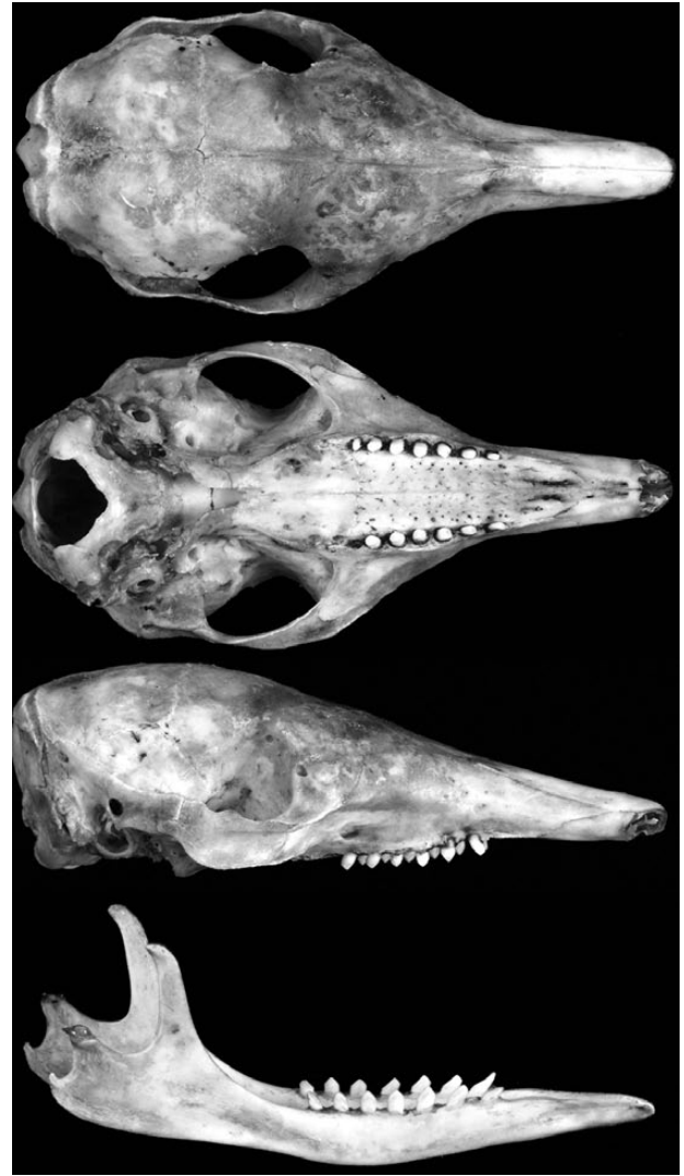
Fig. 3. —Dorsal, ventral, and lateral views of skull and lateral view of mandible of an adult male Dasyus hybridus (MLP 2421 [Facultad de Ciencias Naturales y Museo, Universidad Nacional de La Plata, Argentina, mammal collection]) from Coronel Dorrego, Buenos Aires Province, Argentina. Greatest length of skull is 70 mm.

lateral ones posteriorly. There are 6–7 perforations in the groove that separates the figures. Two parallel, longitudinal lines of small perforations are present on the central figure. Usually there are 3–4 perforations in the posterior border (Vizcaíno and Bargo 1993). The osteoderms of the scapular and pelvic shields are about 5 mm long and 5 mm wide (Fig. 2B). They are predominantly hexagonal and bear a subcircular main figure that is somewhat displaced toward the rear and surrounded by up to 8 small, peripheral figures. One perforation in each intersection of the groove delimits the main figure from the grooves that separate the small peripheral figures from each other (Vizcaíno and Bargo 1993). The osteoderms of the head shield vary in size and shape and lack figures (Fig. 2C).