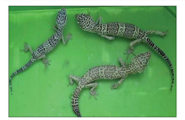
Fig. 1. Three leopard geckos (two females and 1 male) received by veterinary practitioners from a breeder colony in Buenos Aires, Argentina with a history of diarrhea, anorexia and cachexia.