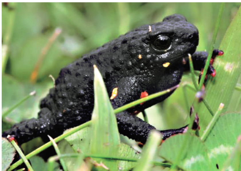
Figure 1. Tandilean red-belly toad, Melanophryniscus aff. montevicensis (2.5cm length).

During an explosive breeding event occurred on October 8 th 2012, we surveyed 40 breeding sites that were being used by Tandilean red-belly toad. Red-belly toads shows explosive breeding events (usually 24 to 48h), usually associated with heavy rainfall (Cairo et al. , 2008). We applied a visual encounter survey (Crump and Scott, 1994) for detecting ponds and toads,