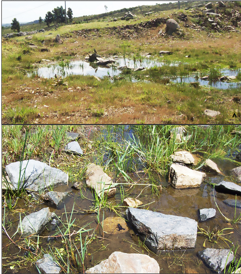
Figure 3. Breeding sites of Melanophryniscus aff. montevidensis at remnants of pampean highland grasslands, municipality Tandil, Buenos Aires Province, Argentina.