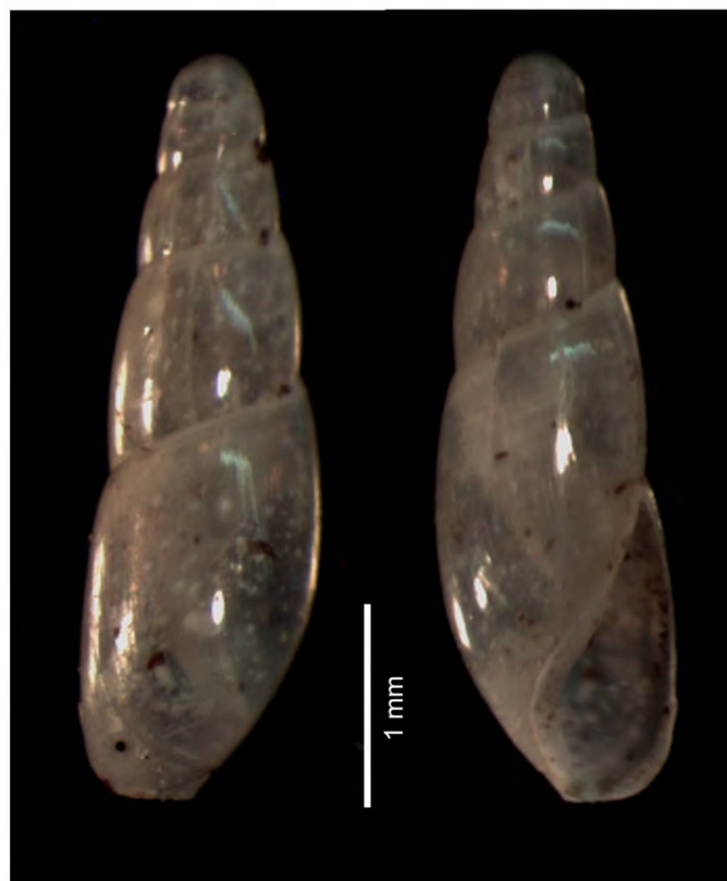
Figure 2. Cecilioides acicula collected in sediments from a grave at the Municipal Cemetery of La Plata, Buenos Aires province, Argentina (MLP-Ma 14219).

Cecilioides consobrina (d'Orbigny, 1837), the only native Cecilioides species in Argentina and Uruguay, presents an elongate-oval shell, shallow sutures and the suture between the last whorl and preceding one is more straight compared with C. acicula .