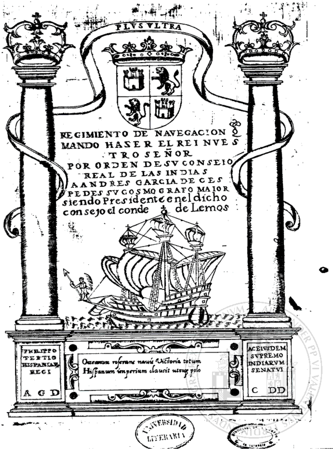
Figure 1. Title page of Regimiento de Navegación by Andrés García de Céspedes (Madrid, 1606)