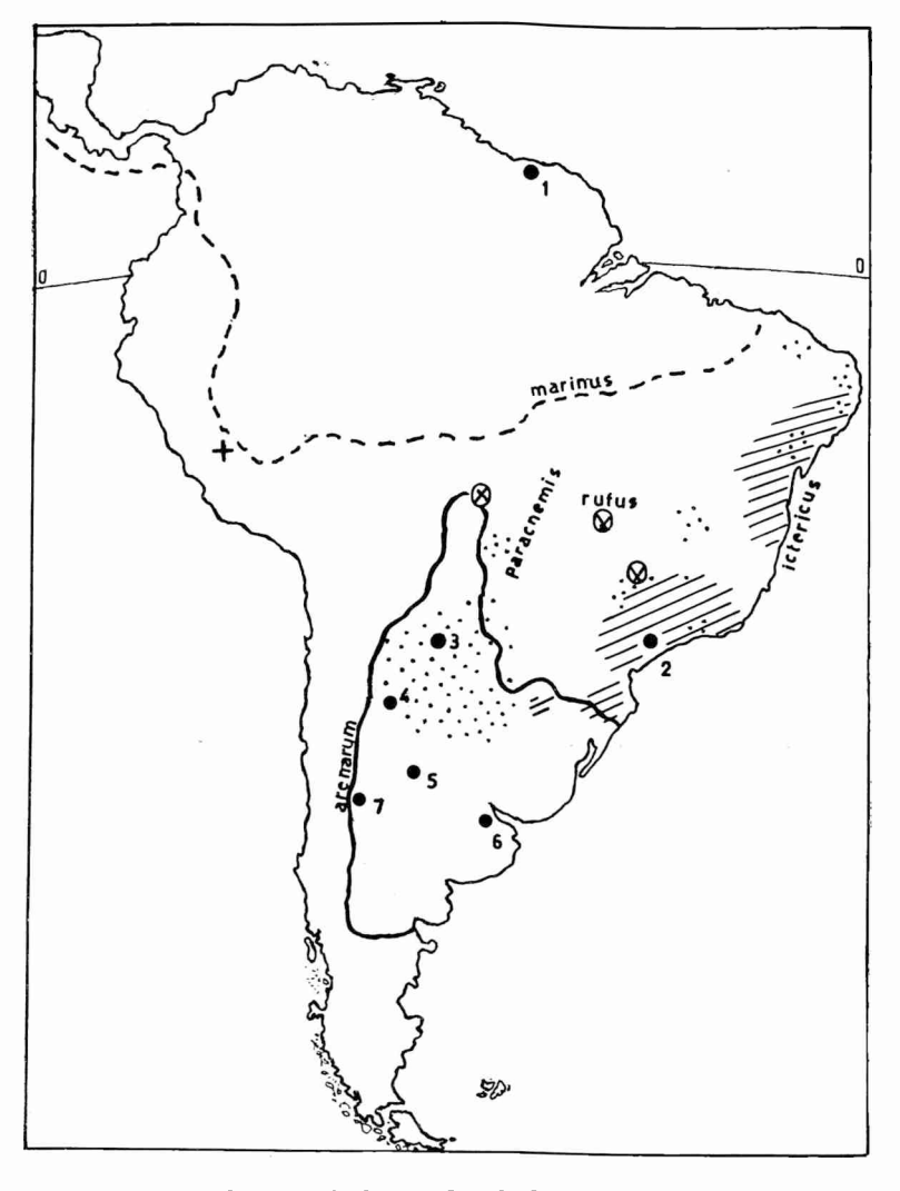
FIG. 1.—Distribution of the toads of the marinus complex in South America.

B. rufus and B. ictericus. B. ictericus is probably sympatric with B. arenarum and B. rufus (see Fig. 1).