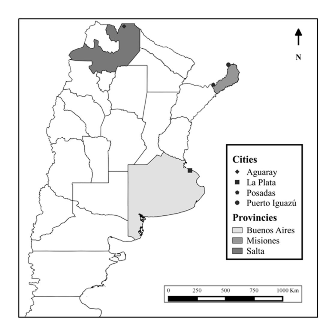
53x53mm (300 x 300 DPI)