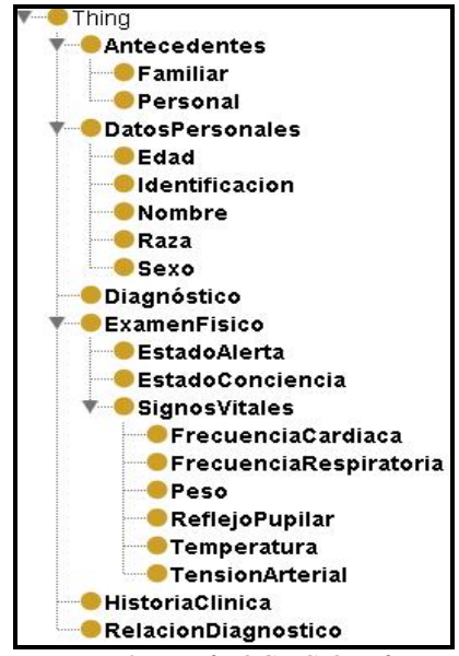
Figure 3. Levels OGHC Ontology

In Knowledge management, some classes of ontology as race " EstadoAlerta " and " EstadoConciencia " (see figure 3) are key criteria for determining possible of preliminary diagnoses if exist case of some very particular symptomatology with characterization that may occur in some populations and cultures.