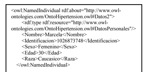
Table 1. Notation OWL in terms RDF for the OGHC Ontology

Additionally, RDF has as native language XML (eXtensible Markup Language) and thus any OWL annotation may be interpreted in terms RDF / XML. The above analysis can be seen in Table 1; we used XML syntax which allows you to specify the relationships between the various entities. It also allows the specification of the properties of each entity and its type.