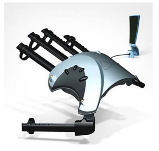
Figure 1: The P5 Glove

With the objective of make an initial approximation to the interactions using non-conventional devices in mind, it was implemented a graph visualization tool prototype that allows user to interact through the P5 virtual reality glove. From this initial approximation, it has been possible to obtain results, many aspects of the problem has been recognized and several conclusions has been extracted which are detailed along the next paragraphs. This non-conventional device was chosen entirely due to its availability.