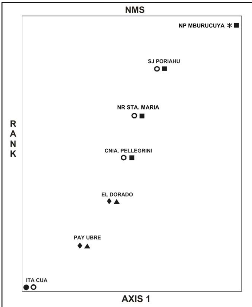
Fig. 3. Ordination analysis (NMS). Biogeographic Province (BP) and Eco-Region (ER) indicated for each locality: ◆, Espinal; ○ Paranense; *, Chaco; ▲, Espinal; ■, Iberá Wetlands; ●, Campos y Malezales.