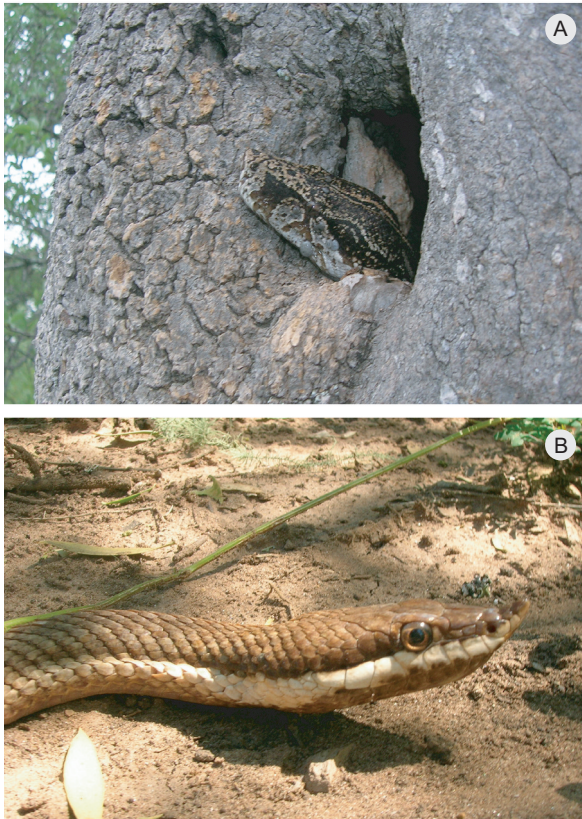
Figure 3. (A) Boa Constrictor Boa constrictor occidentalis visiting an active Blue-fronted Parrot nest cavity. (B) A Baron's Green Racer Philodryas baroni that was removed from a Blue-fronted Parrot nest cavity after partially ingesting a nestling.

one young. The number of surviving nests declined at a higher rate during incubation and the first days after hatching than during the rest of nestling period (Figure 2). Hazard rates were higher during the first days of the nestling stage.