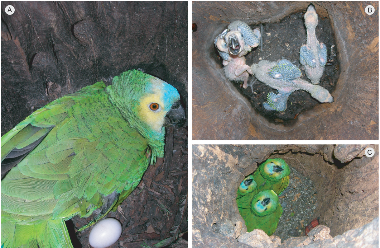
Figure 1. (A) Incubating female Blue-fronted Parrot inside a tree cavity. (B) Brood of four nestlings between 26 and 32 days after hatching and (C) a brood of three nestlings just a few days before leaving the nest. Nestlings fledge on average when they are 58 days old.

We also took the following measurements of the nest entrance hole: height from the ground, minimum and maximum diameter, and inclination. We measured inclination as the angle between an axis perpendicular to the entrance hole area and the vertical line to the ground (see Berkunsky & Reboreda 2009). A value of 90^\circ corresponded to an entrance hole with an axis perpendicular to the vertical plane. Smaller and greater values corresponded to holes that were oriented down or up, respectively. We assigned entrance hole inclination values to one of five categories: -2 = 0^\circ\text{--}22^\circ (facing down), -1 = 23^\circ\text{--}67^\circ , 0 = 68^\circ\text{--}112^\circ , 1 = 113^\circ\text{--}157^\circ , and 2 = 158^\circ\text{--}180^\circ (facing up).