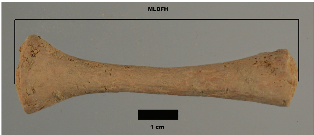
Fig. 2. Maximum length of the diaphysis of the fetal humerus (MLDFH).