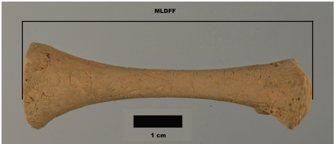
Fig. 1. Maximum length of the diaphysis of the fetal femur (MLDFF).