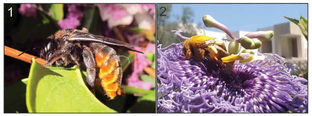
Figures 1–2. Xylocopa (Neoxylocopa) augusti Lepeletier de Saint Fargeau. 1. Female. 2. Male on Passiflora sp. (Passifloraceae).

Chile, namely the Instituto de Entomología of the Universidad Metropolitana de Ciencias de la Educación, Pontificia Universidad Católica de Valparaíso, and the collection Flaminio Ruiz in San Pedro Nolasco.