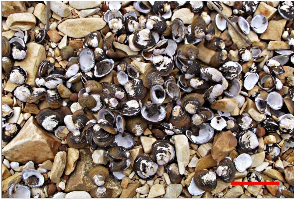
Figure 1. Furnas reservoir sampling site with great accumulation of Corbicula fluminea dead shells, indicating high density of this specie. Bar: 4 cm.

fluminea for the first time in the lower basin of the Brazilian Amazon, where individuals were found in parts of Amazonas and Tocantins rivers, and estimated that the arrival of this species occurred between 1997 and 1998. Santos et al. (2012) also confirmed the presence of this species in upper Parana and lower Amazonas (e.g. Araguaia).