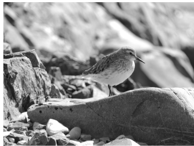
Fig. 2 The White-rumped Sandpiper ( C. fuscicollis ) individual observed closed to Esperanza station at Esperanza/Hope Bay in the north of the Antarctic Peninsula

the station at 10 m from the coast (Fig. 3). At that moment the temperature was above 0^{\circ}\text{C} and the wind calm but that night and during the next 2 days the wind reached maximum speeds of 41, 53 and 55 knots, respectively. Due to weather conditions, we were unable to continue the observations during 4 days and after that the individual was not sighted again.