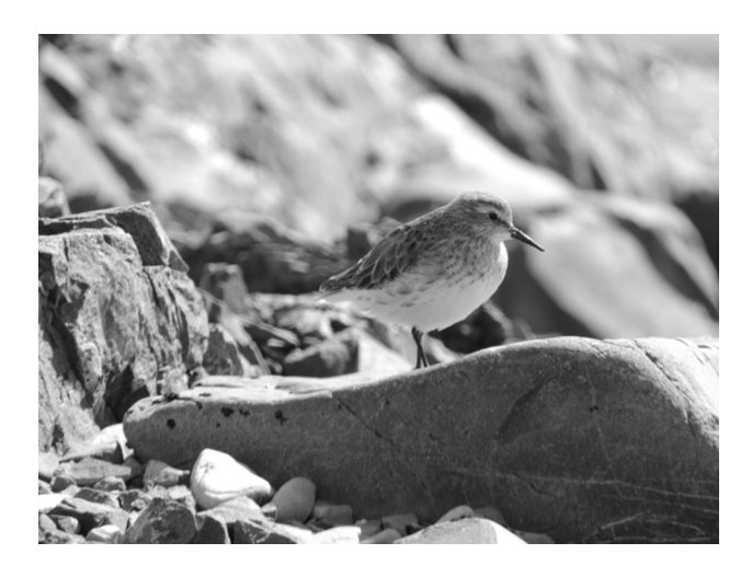
Fig. 2 The White-rumped Sandpiper ( C. fuscicollis ) individual observed closed to Esperanza station at Esperanza/Hope Bay in the north of the Antarctic Peninsula

the station at 10 m from the coast (Fig. 3). At that moment the temperature was above 0 ^{\circ} C and the wind calm but that night and during the next 2 days the wind reached maximum speeds of 41, 53 and 55 knots, respectively. Due to weather conditions, we were unable to continue the observations during 4 days and after that the individual was not sighted again.