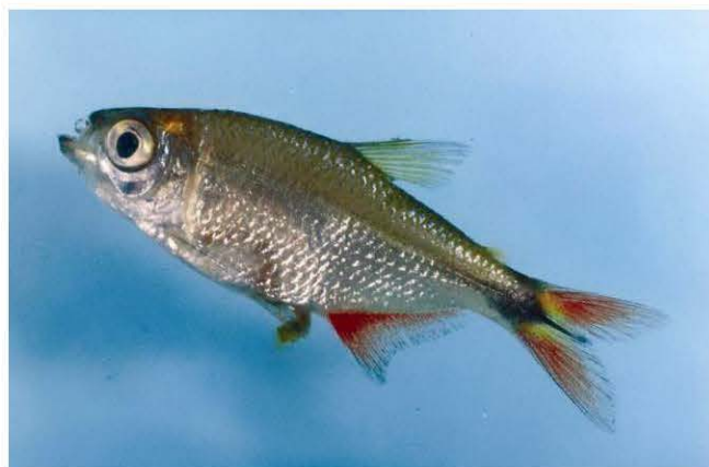
Fig. 1: Hyphessobrycon auca

Hyphessobrycon auca is a poorly known species. Besides, its apparently endemic distribution in fast-growing human activities areas requires more investigations. The aim of the present paper was to describe some aspects of the feeding of H. auca from the type locality. In this sense, this study represents the first contribution to biological knowledge of this species.