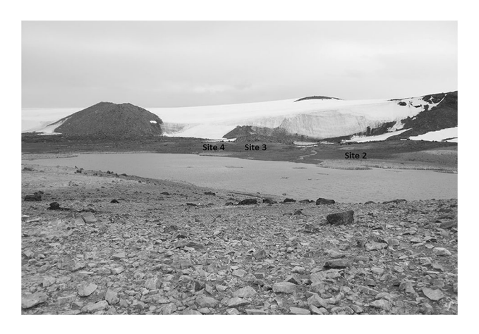
Fig. 4 View of Lake Boeckella looking southeast from the active penguin colony on the west side of the lake. The locations of three abandoned pebble mounds, Sites 2, 3, and 4, are labeled in the figure with the edge of Buenos Aires Glacier in the background. Site 4 provided the oldest radiocarbon date on ornithogenic soil from Hope Bay at 680–515 cal. year BP