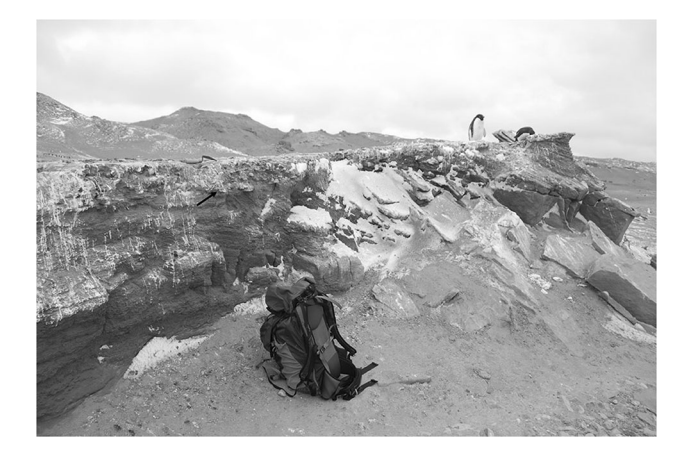
Fig. 3 View of an exposed profile of ornithogenic soils at Penguin Point, Seymour Island, near the front of the beach. Arrow points to the base of the ornithogenic soils where penguin bones and feathers were recovered at \sim 20 cm depth

Our investigations here continue to yield information on the occupation history of pygoscelid penguins, especially Adélie Penguins, in the northern Antarctic Peninsula region. As in previous studies of active and abandoned