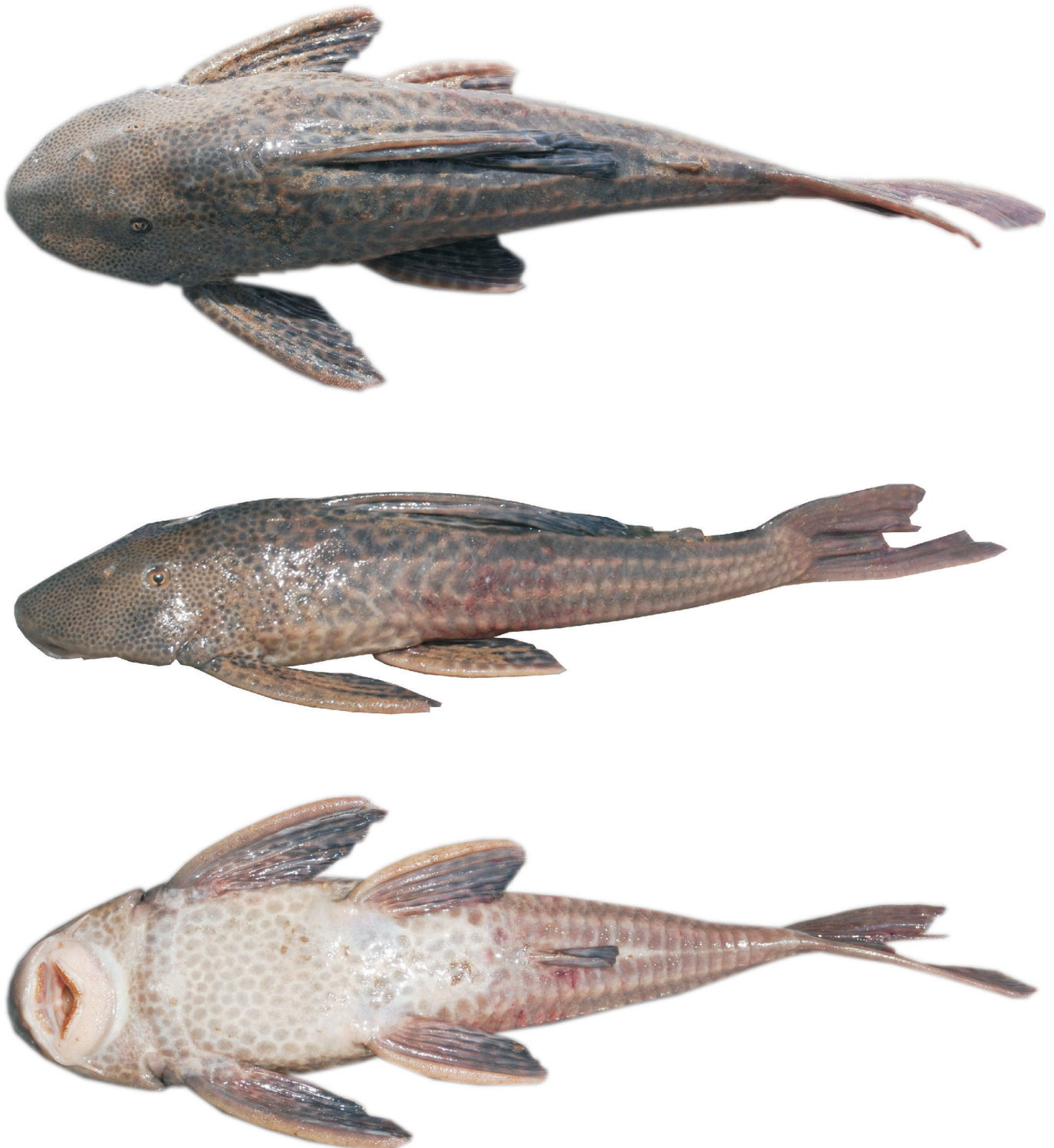
FIGURE 2. Dorsal, lateral and ventral views of a live specimen of Hypostomus aspilogaster collected in the stream Mandisoví Grande, Entre Ríos province, Argentina. ILPLA 2156, (YC09-090), 285.2 mm SL.

An analysis which makes up molecular, morphometric and meristic data represents an invaluable tool for clarifying the systematics of complex groups on which, at the moment, we do not have complete knowledge. As an outcome of this integrated analysis, we allow to extend the distribution of H. aspilogaster in the Neotropical Region and present the first record of this species in Argentina.