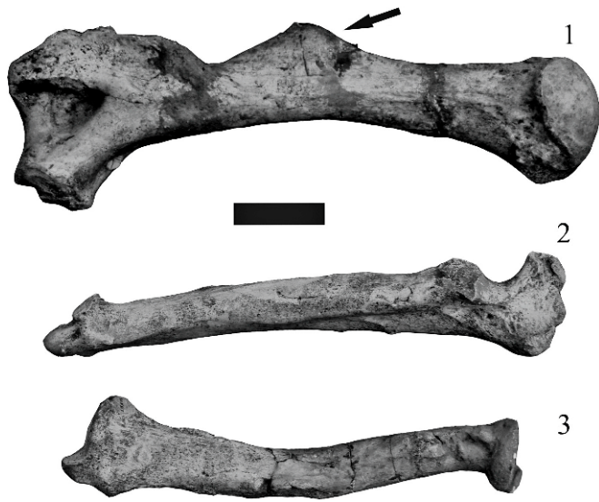
FIGURE 3— Arctotherium angustidens specimens reported here. 1, MLP 35-IX-26-5 left humerus in caudal view; 2, MLP 35-IX-26-3 left ulna in lateral view; 3, MLP 35-IX-26-4 left radius in lateral view. Black arrow points to a pathology. Scale bar is 10 cm.