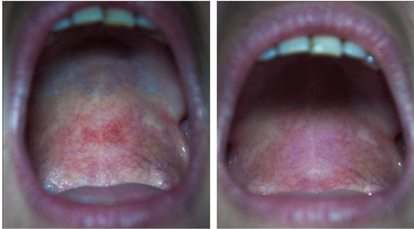
Figure 3. Oral optical biopsy