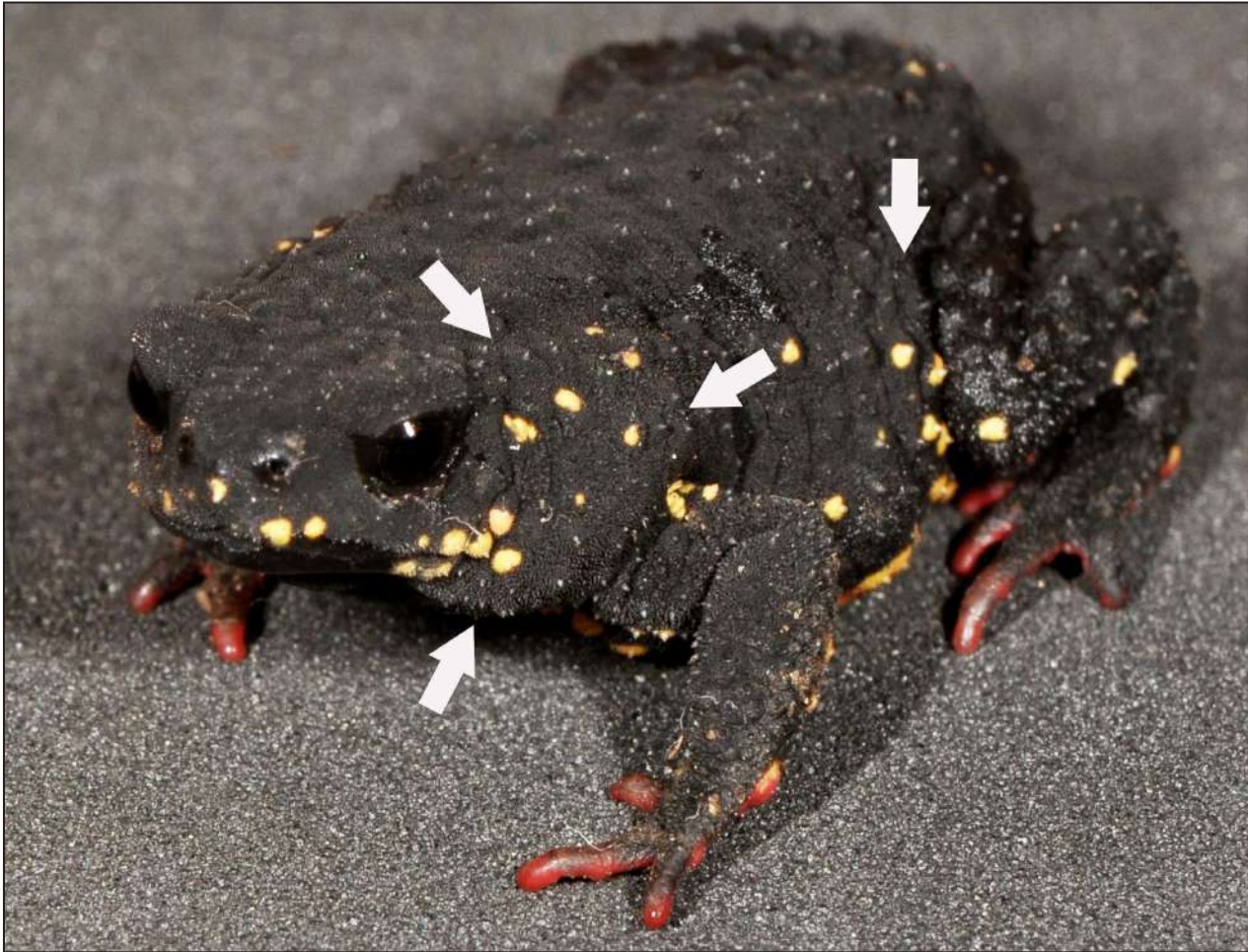
Figure 1. Lipoma in Melanophryniscus montevidensis . Arrows on the left indicate approximate boundaries of the tumour in the subcutaneous tissue of the cephalic region, which are evident externally; vertical one corresponds to its posterior limits.

Lipomas are benign and slow growing tumours (Hendrick, 2017), and their presentation in wild vertebrates seems to be sporadic. Particularly in amphibians there are only three previously published case reports, the first one is that of Reichenbach-Klinke and Elkan (1965) who describe this neoplasia associated to the urinary bladder in a toad Bufo bufo (Bufonidae). The other two known cases, like in the present study, correspond to single and circumscribed subcutaneous lipomas in Xenopus laevis (Pipidae; Balls, 1962) and Melanophryniscus sanmartini (Borteiro et al. , 2017). In these two reports the lipomas were approximately ovoid and relatively small masses located in the dorsum. As a difference, the lipoma in the present case largely extended over the flank. Similarly to the case in M. sanmartini , chromatophore cells were present but scarce.