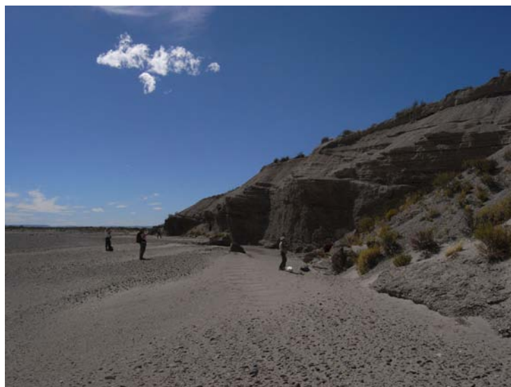
Figure 5. Section in marine deposits along the Cañadón Malaspina.

high concentration of organic material. Generally they are covered by typical halophyte plants.