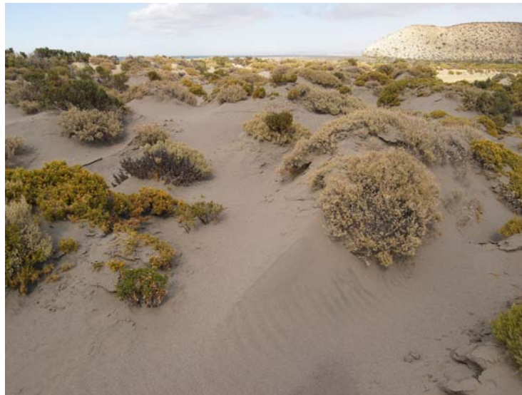
Figure 8. Tidal area at Cañadón Restinga mouth.

Carta Topográfica de la República Argentina maps (1:100,000 scale) were used for elevation points and toponyms. Each set of images was converted to the Universal Transverse Mercator (UTM) projection (WGS 84 Datum, 20N zone). Geomorphological features were digitally drawn in a geographical information system (GIS) environment by analysing satellite images and shaded images derived from DEMs. Most of the mapping was performed using high resolution Quick Bird images; Landsat and shaded DEM images were used only where cloud cover intervened due to their low spatial resolution. Landforms were initially mapped at the maximum resolution allowed and then shown to a scale of 1:100,000 for printing.