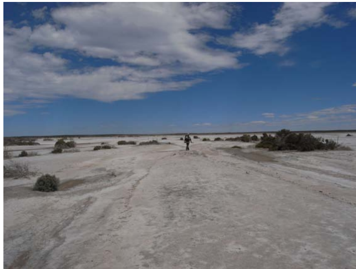
Figure 4. Salitral near the village in Bahía Bustamante.