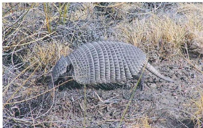
Fig. 1.—A female juvenile Zaedyus pichiy from Malargüe Department, Mendoza Province, Argentina.

[ Dasypus ] ciliatus G. Fischer, 1814:127. Type localities “ad meridiem Boni Aeris , (Buenos Ayres) inde a parallela gradus 36 latitudinis meridionalis usque ad terram Patagonum ,” junior objective synonym of Loricatus pichiy Desmarest, 1804.