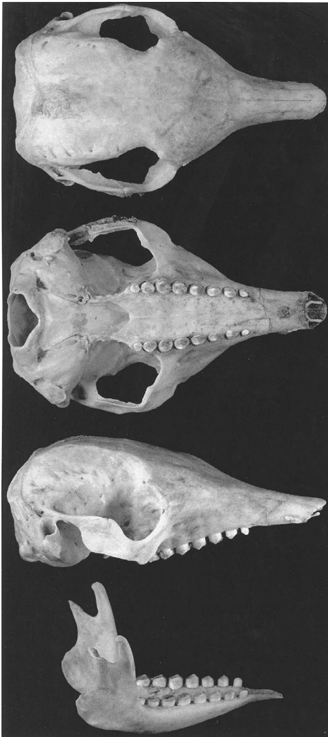
Fig. 2. —Dorsal, ventral, and lateral views of skull and lateral view of mandible of an adult male Zaedyus pichiy (MLP [Facultad de Ciencias Naturales y Museo, Universidad Nacional de La Plata, Argentina, mammal collection] 7.V.10.2) from Cerro Nevado, Malargüe, Mendoza, Argentina. Field number of specimen is ZP 43 (MS). Greatest length of skull is 62 mm.

those that subdivide the lateral figures. The posterior border of the lateral figures is thin and has small piliferous foramina, the most conspicuous foramen being located on the central figure (Vizcaino and Bargo 1993). The osteoderms of the scapular and pelvic shields are subquadratic to rectangular, with a proportionally higher number of the former than in members of Chaetophractus . The osteoderms are about 9.5 mm long and 7.5 mm wide and bear a central figure that reaches their posterior margin as well as peripheral, but no secondary figures (Fig. 3B). The central and peripheral figures are more convex than those in Chaetophractus . The osteoderms of the head shield vary in size and shape, and lack figures or perforations (Fig. 3C). The osteoderms form a pattern that is unique for each individual.