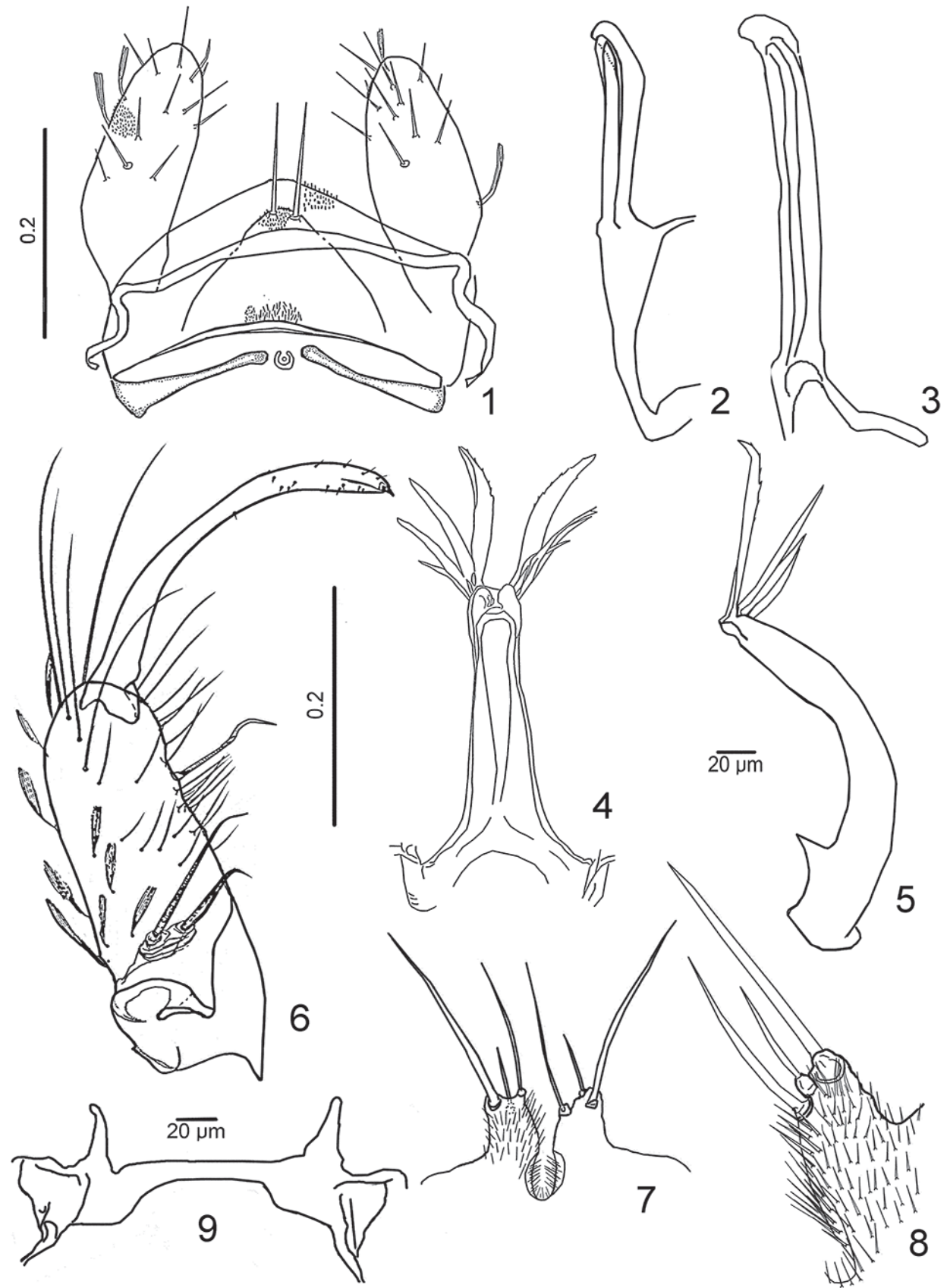
Figs 1–9, Anopheles (Anopheles) annulipalpis Lynch Arribálzaga, 1878. 1, Female genitalia; 2–9, male genitalia: 2, dorsal lobe of Claspette; 3, setae of dorsal lobe of Claspette; 4, aedeagus; 5, lateral view of aedeagus; 6, gonocoxite and gonostylus dorsal aspect (prerotation sense); 7, ventral lobe of Claspette; 8, detail of ventral lobe of Claspette; 9, IX-Tergum. Scales in mm, except when indicated.