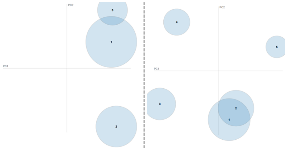
Fig. 2. Topic schemes for LDA over volume 2 of GD. At the left side, LDA topics over the complete chapters. At the right side, LDA over 65 documents extracted from the volume.